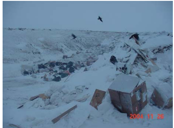
Figure 6. Waste Disposal. SWDF domestic garbage disposal area.