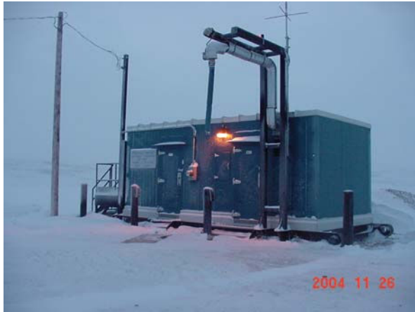
Figure 1. Water Supply. WSF at New Water Lake.