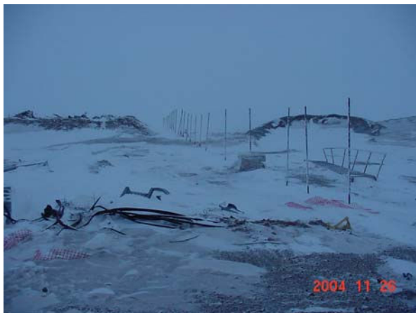
Figure 7. Waste Disposal. SWD east containment fence.