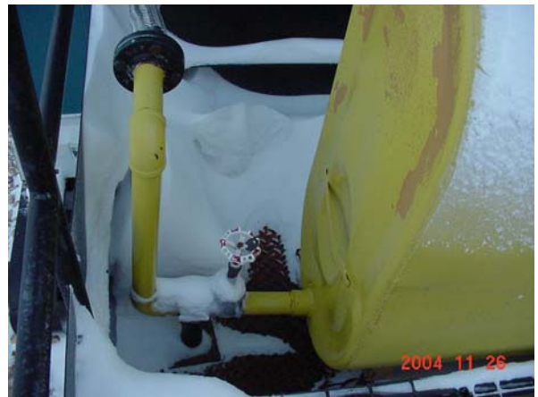
Figure 4. Water Supply. WSF fuel storage.