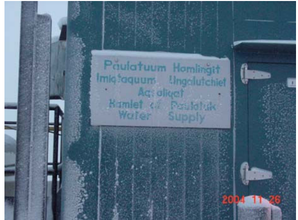
Figure 2. Water Supply. WSF signage.