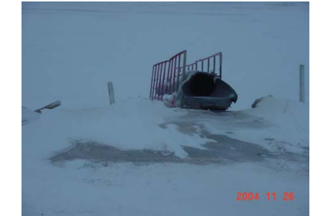
Figure 5. Waste Disposal. Sewage Lagoon intake structure.