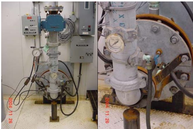
Figure 3. Water Supply. WSF intake and SNP 1619-1 sampling location.