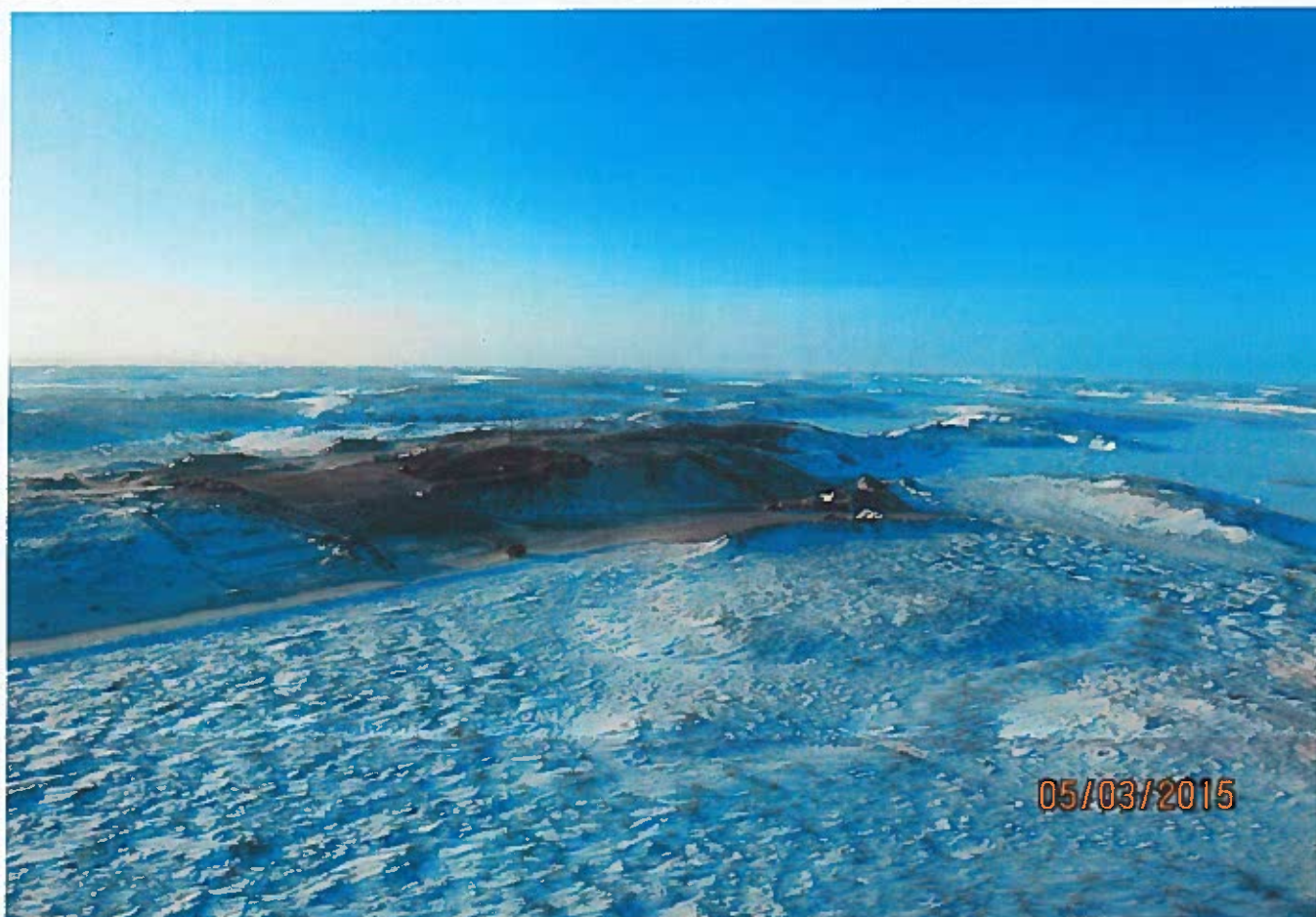
Aerial of Source 174