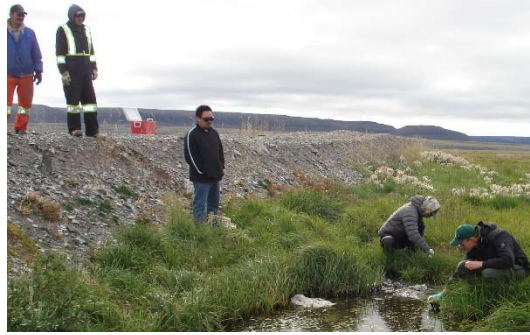
IWB Staff and WRO sample Ulukhaktok Sewage discharge—August 18, 2015