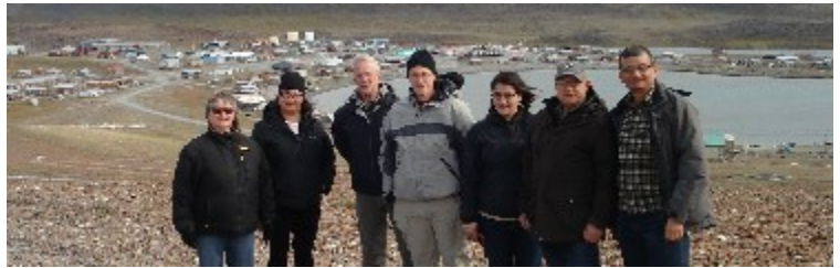
IWB members and staff with Hamlet of Ulukhaktok in the background.

"Well Done Ulukhaktok, Keep it Up!" from the IWB