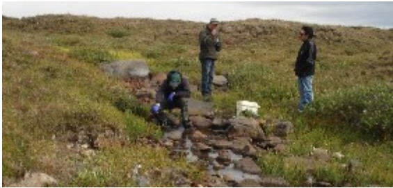
Hamlet Staff and ENR Officer collecting effluent samples before final discharge into the ocean.

Sewage is collected from household holding tanks and transported to the sewage disposal facility (bermed lagoon) by sewage vacuum truck. Sewage is treated through natural processes in the lagoon and seeps through the containment walls of the lagoon into a low lying wetland drainage area where additional natural treatment occurs before final discharge into the ocean.